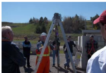
Confined space training held on April 30 included hands-on rescue training