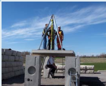
A simulated confined space is set-up in the yard at Wilkinson Heavy Precast during Confined Space Training.