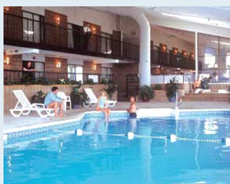
Delegates can come for business and pleasure at Pembroke's Best Western for the 2007 CPA Convention November 25, 26 & 27.