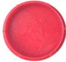
CPA's signature Red Tag helps inspectors recognize compliant tanks.