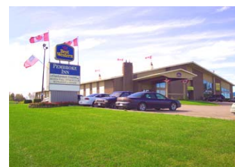
The Best Western in Pembroke will be the location of the 2007 CPA Convention.

This November 25 th , 26 th & 27 th will find CPA members in the heart of the Ottawa Valley for the 17 th Annual CPA Convention.