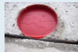
Members of the CPA Registration Program identify registered products with this "Red Tag".

We hope to conduct the first inspections this season.