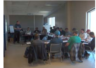
Fifteen participants from five manufacturing plants were trained in Confined Space Entry Rescue.

If you are interested in such training but were not able to take advantage of this training opportunity in April, please contact the CPA office.