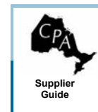
The new CPA Supplier Guide: your premier source for concrete manufacturing supplies & services.

You'll find this Guide enclosed with this Newsletter. Supplier information is also available online at www.cpaontario.com .