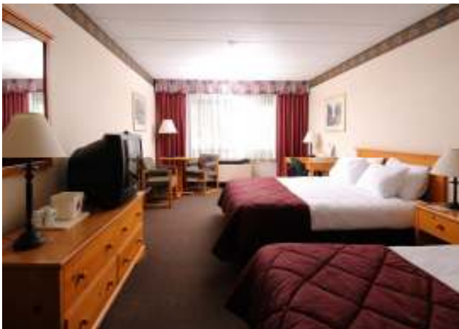
Standard Room: $114.99

The deadline for Hotel reservations is October 20 th , 2011.