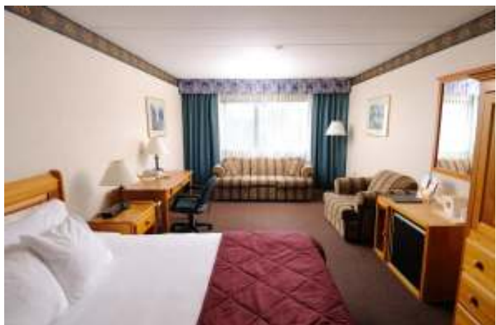
Executive Room: $124.99